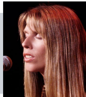
Aretha Franklin.